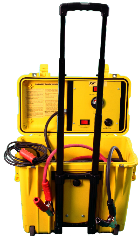
Easily Portable: Only 37 lbs.

Heavy Duty Jump-Start Cart Giving An Engine The Power It Needs To Start.